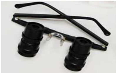
Figure 3. Spectacle-Mounted Magnifier

Spectacle-mounted magnifiers require prescription by an eye-care professional. They are also somewhat expensive, with least-costly models starting at about $100. Many patients need instruction on how to use these devices correctly.