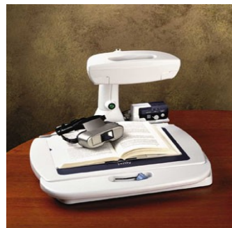
Figure 2. Stand Magnifier

Stand magnifiers are magnifying lenses mounted on a stand that typically sits on a desk top. As with hand-held magnifiers, they can be illuminated. Their main advantage over hand-held magnifiers is that they free the hands and often can be used by people with tremor. Some sit over text on four legs and have large view areas; others are mounted on fixed or goose-neck stands. Cost varies from around $15 for simple models to as high as $200 for more sophisticated models (Figure 2).